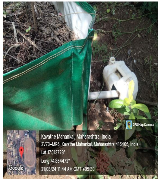
Vermiwash collecting Can